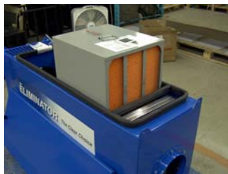
Turbulent Flow Precipitator