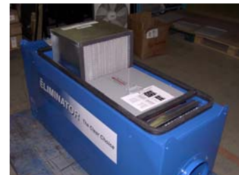
Optional Post Filter 95% ASHRAE , 95% D.O.P., 99.97% HEPA

Available in sizes from 500 cfm to 10,000 cfm To find out more about this amazing new technology, visit the web site.